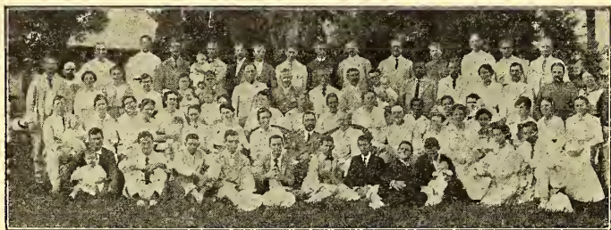
THE 1918 CONFERENCE

realized that unity and coöperation were the price of their existence. At the present time the Conference is composed of some fourteen societies. They meet once every four years for the purpose of hearing reports on the work of the different missions and for the laying of plans that will promote the kingdom of Christ. The sessions of the Conference of necessity last only a few days and then the workers return to their widely scattered fields. That the Conference may accomplish the purpose for which it was founded it was necessary to devise some means by which their plans could be carried out during the long interim